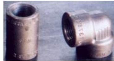
Elbow, Tee, Coupling